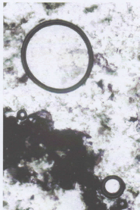
Coacervates, created using a carbohydrate and protein solution, and stained with Congo red

The Oparin-Haldane hypothesis inspired the famous experiment by Stanley Miller and Harold Urey in 1953. The Miller-Urey model recreates the possible conditions of Earth's early atmosphere and primordial sea. The atmosphere of primitive Earth was mostly composed of volcanic vapors, such as methane, ammonia, and hydrogen. These gases would have dissolved into the primordial sea, causing the water to become acidic. The atmosphere would not become oxygenated until cyanobacteria and other photosynthesizers evolved. There was intense UV radiation, along with frequent lightning strikes and meteorite impacts on the Earth's surface. In the experiment undertaken by Miller and Urey, water simulates the primitive sea. The water is heated and evaporates from a flask into a chamber containing methane, ammonia, and hydrogen. The chamber is sparked, simulating the lightning storms in the early atmosphere, and then the gas is condensed into a liquid and collected. Miller and Urey found that the resulting solution changed from colorless to murky brown. The solution was found to contain organic molecules, including some amino acids found in living organisms.